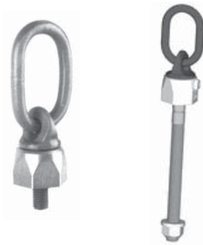
Lifting points bolted WBG-V / WBG

This safety instruction / declaration of the manufacturer has to be kept on file for the whole lifetime of the product.